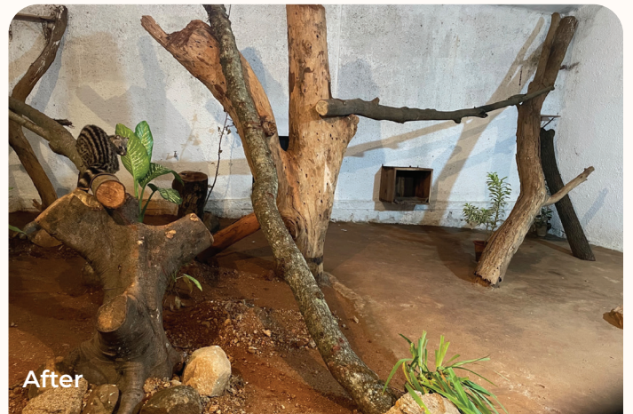
Small Indian Civet Enclosure