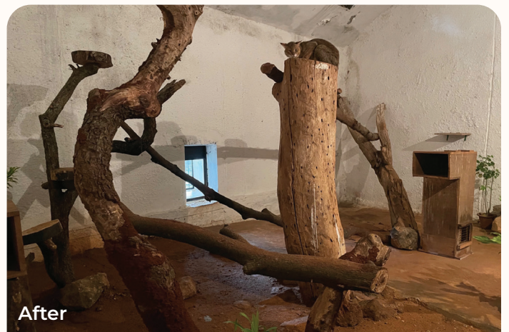
Jungle Cat Enclosure