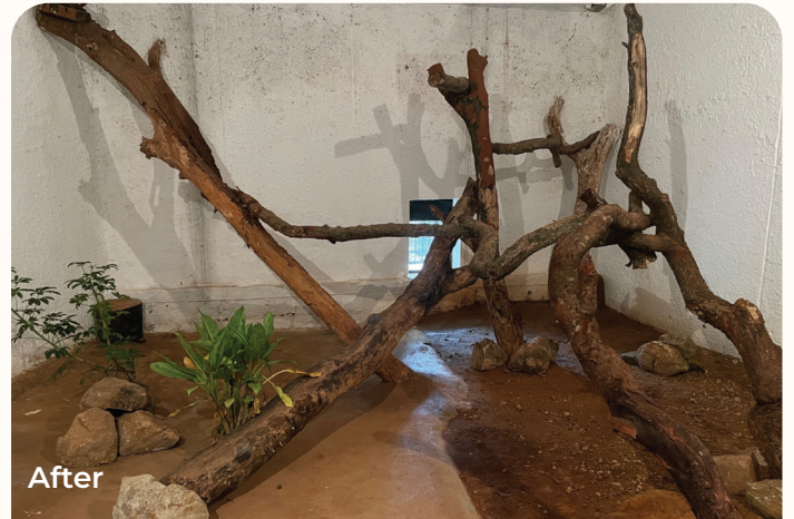
Leopard Cat Enclosure