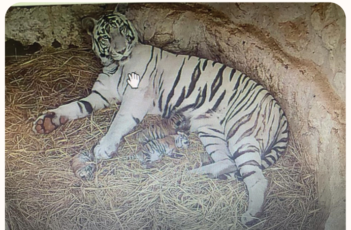
Tiger Cubs were under continuous observation through Cctv camera