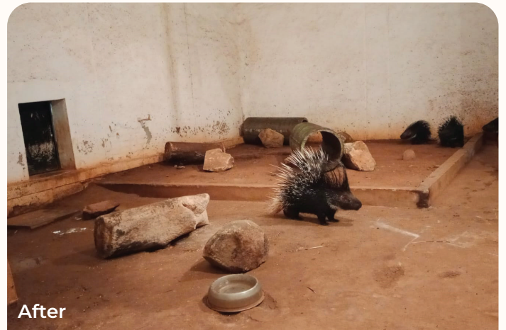
Indian Crested Porcupine Enclosure