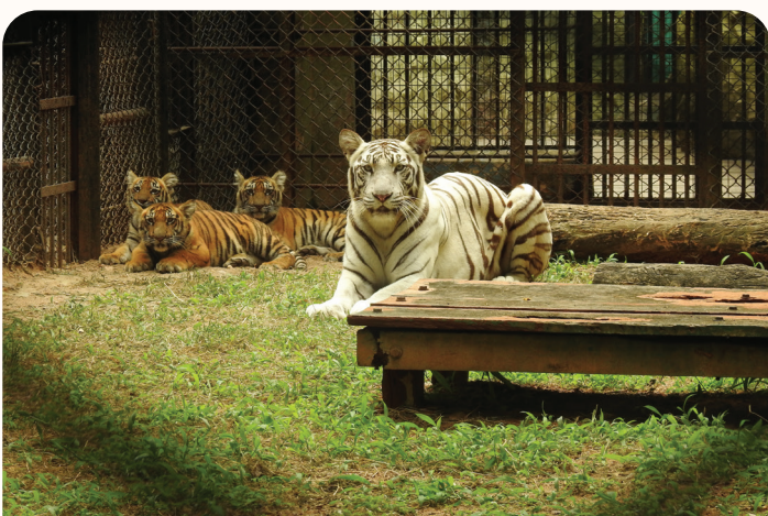
Tiger Tara with her cubs