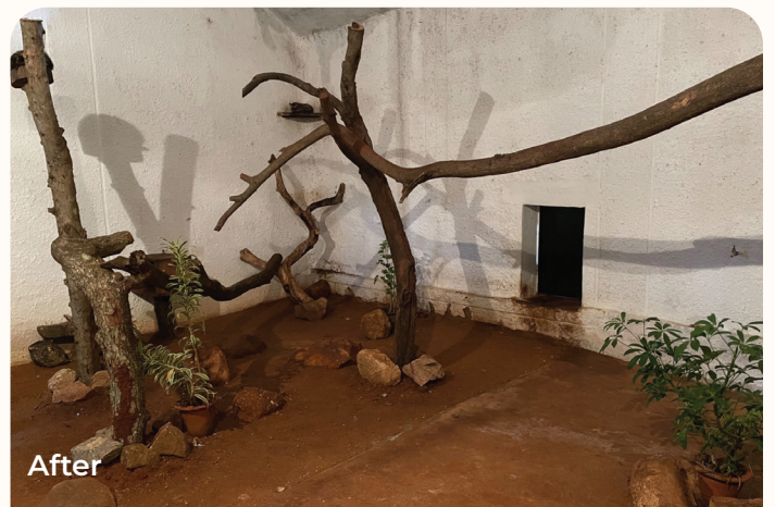
Common Palm Civet Enclosure