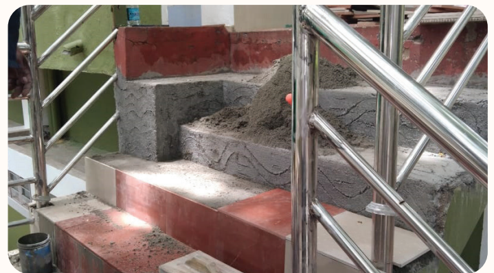
vi. Providing enrichment works and painting to Baboon enclosure